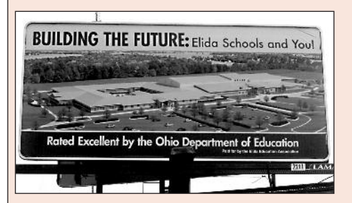
Using a NWOEA PR Grant, the Elida EA and the Elida Board of Education show their pride in their school system and their community

The Elida Education Association teamed up with the Elida School Board and rented a billboard on one of the busiest roads in front of the city's largest retail store. The billboard shows the latest architectural picture of the new high school that will be open for the 2011-2012 school year. Across the top of the billboard are the words "BUILDING THE FUTURE: Elida Schools and You!" to publicize the collaborative efforts given by the Elida school system and the community for quality education. The bottom of the billboard indicates the second year the Elida Local School District has received an excellent rating by the Ohio Department of Education.