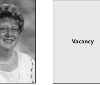
NEA Director #6