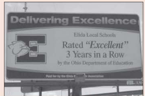
Using an NWOEA PR Grant, the Elida EA and the Elida Board of Education show their pride in their school system.

billboard for one month to show the community the accomplishments that the students, teachers, building staff, and community have achieved. Located on one of the busiest roads in front of the city's largest retail store, the billboard boasts the Elida Local Schools' excellent rating for three years in a row!