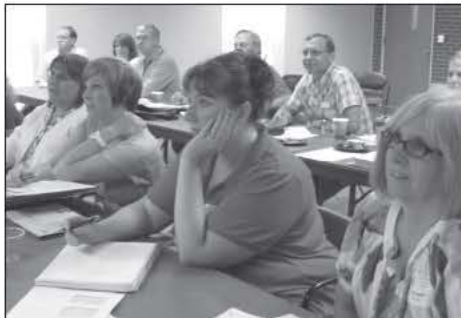
Local leaders listen intently, ready to take notes as they are given practical tips regarding their role in the local association.