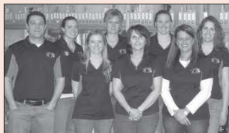
Wearing their new MTEA polo shirts has promoted unity and pride among the members of the McComb Teachers' Education Association.

For the third time the Elida Education Association (EEA) has teamed up with the Elida School Board to rent a