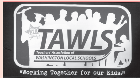
To celebrate the association's achievements and 50th anniversary, TAWLS used an NWEOA PR Grant to rent billboards in the community.

The Teachers' Association of Washington Local Schools (TAWLS) also applied for an NWEOA PR Grant this year to purchase space on local billboards within the district. The billboard was designed to celebrate the association's achievements, its 50th anniversary, and the success that teachers make every day in the lives of kids.