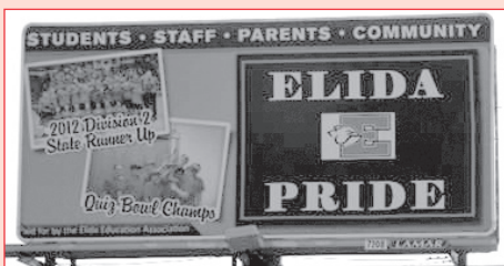
Using an NWEOA PR Grant, the Elida EA purchased this billboard ad strategically placed in a highly trafficked spot in town.

The Gibsonburg Teachers Association (GTA) used an NWEOA PR Grant to help supplement the cost to purchase polo shirts for all association members. Having obtained "Excellent" status for 2011-2012 and with a new income tax to be placed on the May ballot (the first in 20 years), GTA wanted to be sure to get the Excellence in Education message out to the community. By wearing the polo shirts, GTA members were visually reminding the community of their achievements.