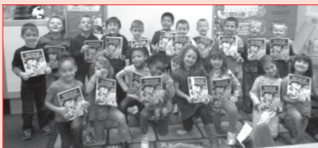
Findlay kindergartners proudly display their new books presented by Findlay EA and funded with an NWEOA PR Grant.

To welcome new students to Findlay City Schools, each child in kindergarten was given a picture book compliments of the Findlay Education Association with funding from an NWEOA PR Grant. The project provided kindergarten teachers the opportunity to use the books instructionally, and the children were then given the books to take home.