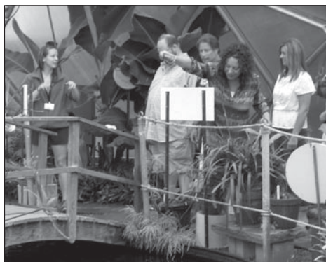
NWOEA Board Members are amazed at the organically grown flowers, herbs, and vegetables in the Geodesic Biodome while touring the Stranahan estate before starting a busy day at the June Retreat at the 577 Foundation House.

The Board adopted the 2014-2015 calendar and approved NWOEA and OEA committee appointments. A motion passed to continue funding the Local Delegate Assistance to OEA Spring RA Engage Grant. NWOEA Committee Chairs and NWOEA Representatives on OEA Committees, who were in attendance, gave reports and updates. A dinner at the Social Restaurant followed the afternoon meeting. ■