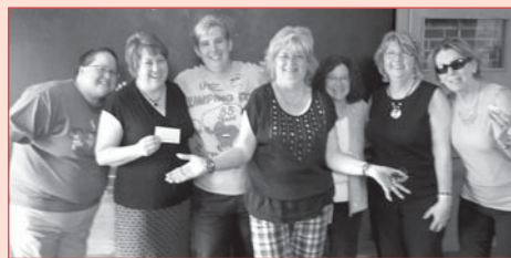
Kenton EA members join together to thank the local association for the gift cards purchased with NWEOA PR Grant funds and given by the Kenton EA in recognition of their years of membership in the local association.

The Kenton Education Association (KEA) used funding from this year's PR Grant to provide a gift card to every member on "Teachers' Appreciation Day" in May. The monetary amount of a gift card was based on the number of years of membership in the local association. This project let KEA members know how much they are appreciated for remaining loyal members of KEA during hard times when they could have easily opted not to join and pay dues.