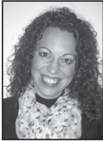
September Kuebler Unit I Bowling Green