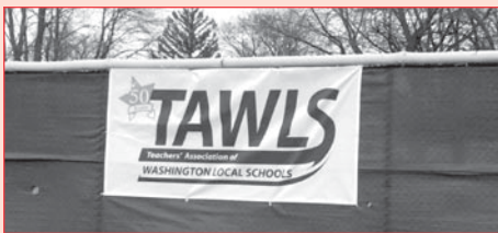
TAWLS shows the community its support for the baseball program through an association banner on the Whitmer baseball field fence.

To continue communicating its message and role in the community and supporting school programs, the Teachers' Association of Washington Local Schools (TAWLS) sponsored signage at the newly renovated Whitmer baseball stadium. TAWLS used its NWEOA PR Grant to purchase a 4' x 8' banner printed with the association's name and its 50th anniversary logo.