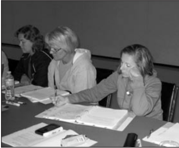
Local treasurers use highlighters and sticky notes to mark important information at the NWOEA Treasurer's Workshop.

Non-Profit Org. U.S. POSTAGE PAID Findlay, Ohio Permit No. 78