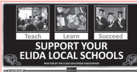
Using an NWEOA PR Grant, the Elida EA purchased this billboard ad strategically placed in a highly trafficked spot in town.

Elida EA continued its tradition of purchasing the rental of a billboard to show the community the accomplishments that the students, teachers, and building staff have achieved. This year the big billboard dressed in the school's colors of black, white, and orange encouraged the community to "Support Your Elida Local Schools." The billboard was strategically located on one of the city's busiest roads.