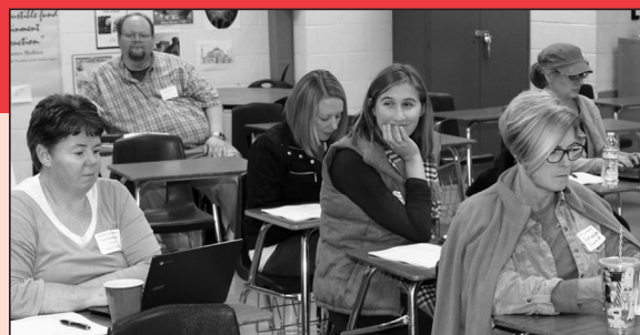
Members attending the session Google for Educators consider how they can enhance classroom instruction and become paperless.