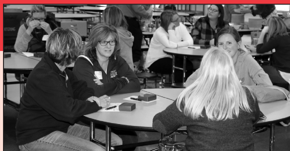
Members network with one another prior to dinner at the Fall Workshop held this year at Perrysburg Junior High School.