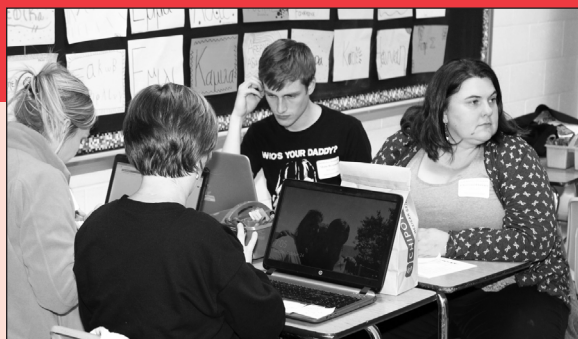
During the breakout session Using Digital Instruction to Individualize and Differentiate Learning for All Students members learn how to use technology to meet the needs of all students.